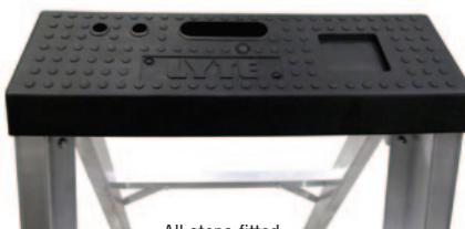
All steps fitted with tool tray