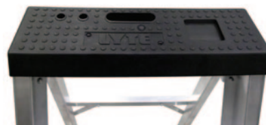
All steps fitted with tool tray