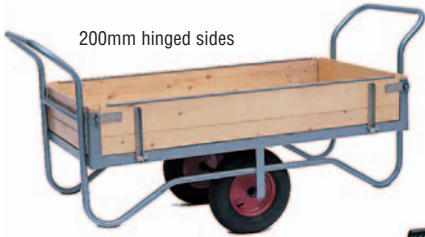
200mm hinged sides