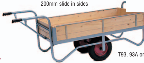
200mm slide in sides