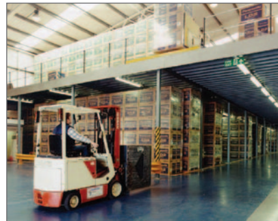
• Steel structural work incorporating a mezzanine floor