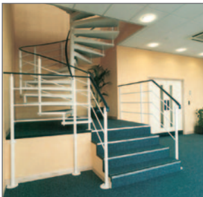
• Internal staircase