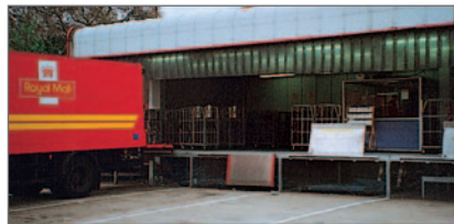
• Loading dock installation for the Royal Mail