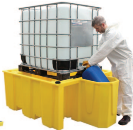
BB1 shown with optional BB1T overflow tray