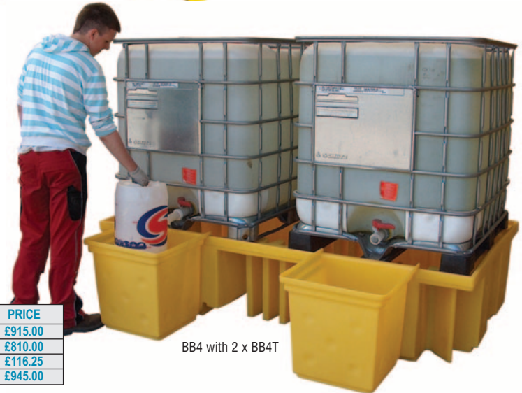
BB4 with 2 x BB4T