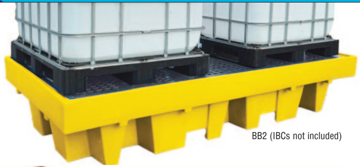
BB2 (IBCs not included)