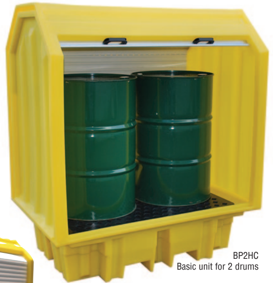
BP2HC Basic unit for 2 drums