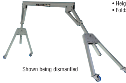
Shown being dismantled