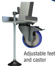
Adjustable feet and castor