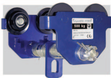
Push travel trolley