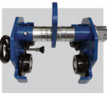
Push travel trolley with locking device