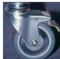
Wheel brakes to all castors