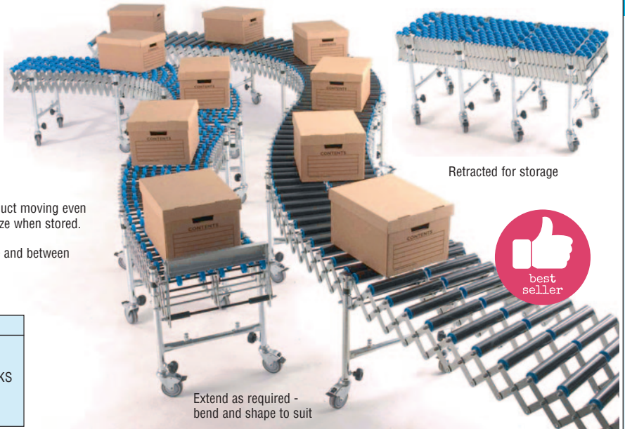
Retracted for storage