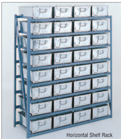
Horizontal Shelf Rack

Priced per tier. State number of tiers when ordering.