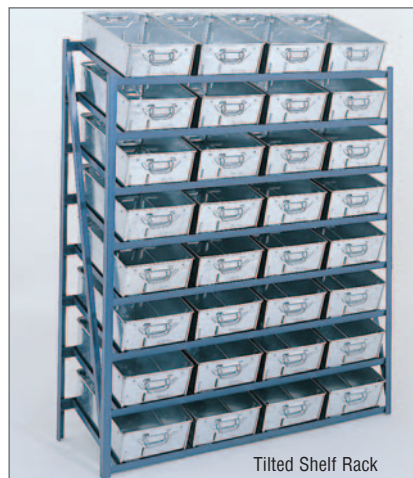
Tilted Shelf Rack