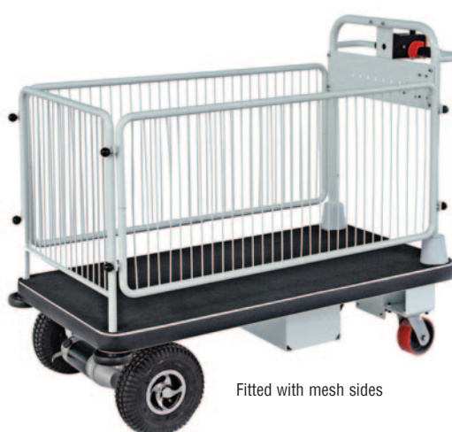
Fitted with mesh sides