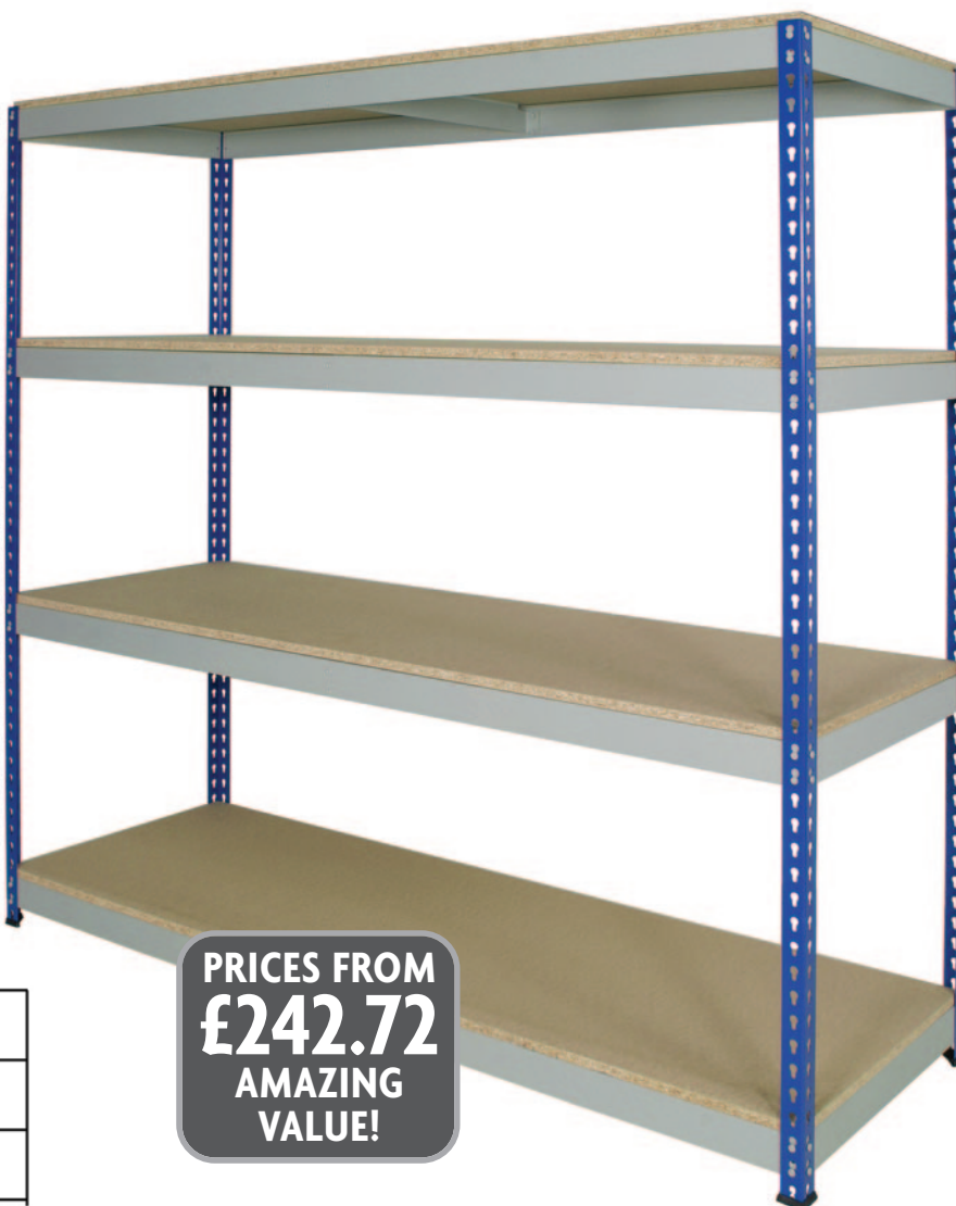
Available Heights (mm)