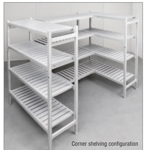
Corner shelving configuration