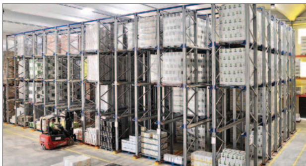
• All styles of pallet racking systems are available. Please contact us.