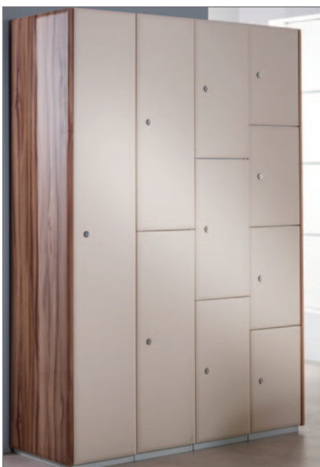
Noce Marino Walnut (gloss) end panels with Sand Beige doors