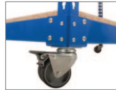
• Castor base showing braked castors.