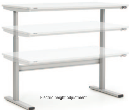
Electric height adjustment