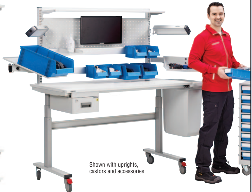
Shown with uprights, castors and accessories