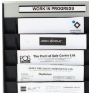
A4 job card racks like this can be mounted on the stand