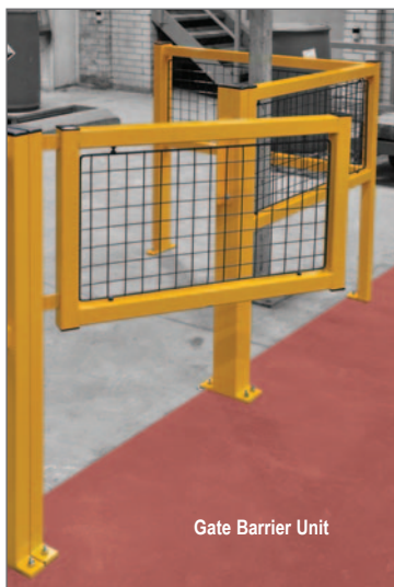
Gate Barrier Unit