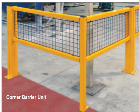
Corner Barrier Unit