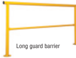
Long guard barrier