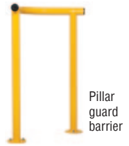
Pillar guard barrier