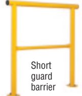
Short guard barrier