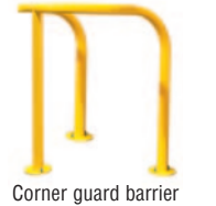
Corner guard barrier