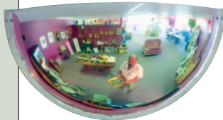
Half face wall mirror