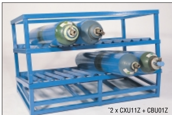
2 x CXU11Z + CBU01Z

Each unit has a capacity for 11 cylinders stored horizontally. The units are stackable, with or without the slanting base which allows 4 way entry for loading or unloading by fork lift truck.