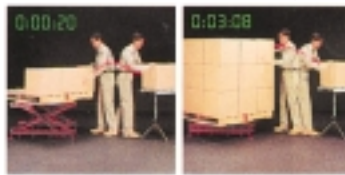
WITH PALLET-PAL - it's easy

Time: 3 mins 8 secs. Work expended 75Kg.m